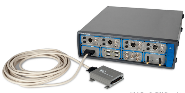
APx525 with PDM 16 module attached to remote interface pod